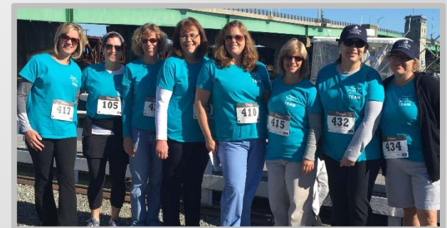
Women's Health Care team at the Greater Newburyport Ovarian Cancer Awareness Annual 5K