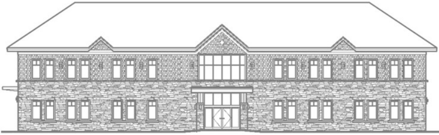
RENDERING OF BUILDING